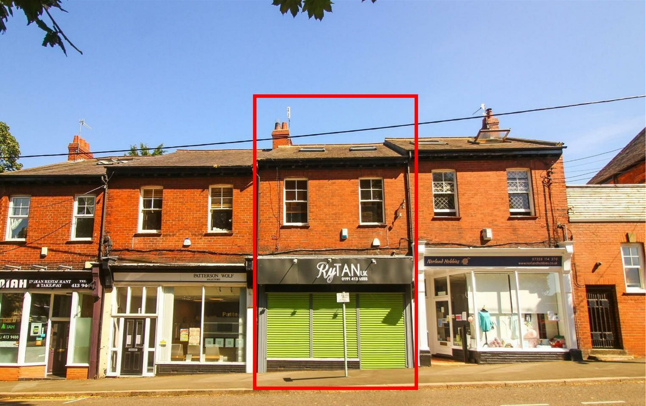
📍 Lane Head, Ryton NE40 3HF